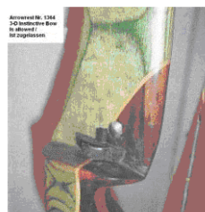
1364: Is allowed

For the "Instinctive bow" division, the photo #1360 is definitely not allowed. However, the arrow rest in photo #1364 is allowed. The bow in #1364 has a small pressure pad, but not a pressure button and the rest is of a very simple design. We take it, that pressure button means cushion plunger, which is clearly the case in photo #1360 and therefore that arrow rest/pressure button combination is not legal for the instinctive bow class. Article 11.10.3.2.2.2 reads: Either no arrow rest is used or only a simple arrow rest without pressure-button and without overdraw can be used.